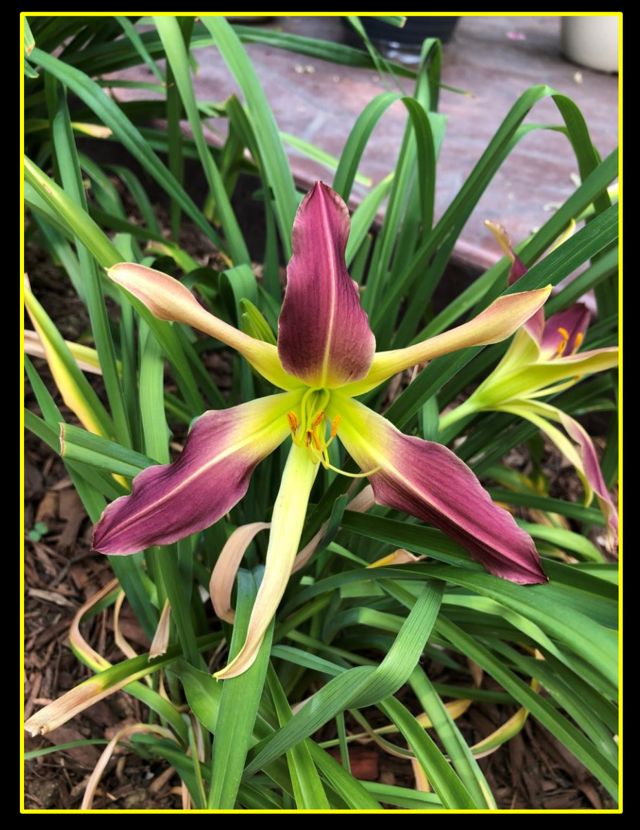
9-125-2 Russell bicolor x Spindazzle