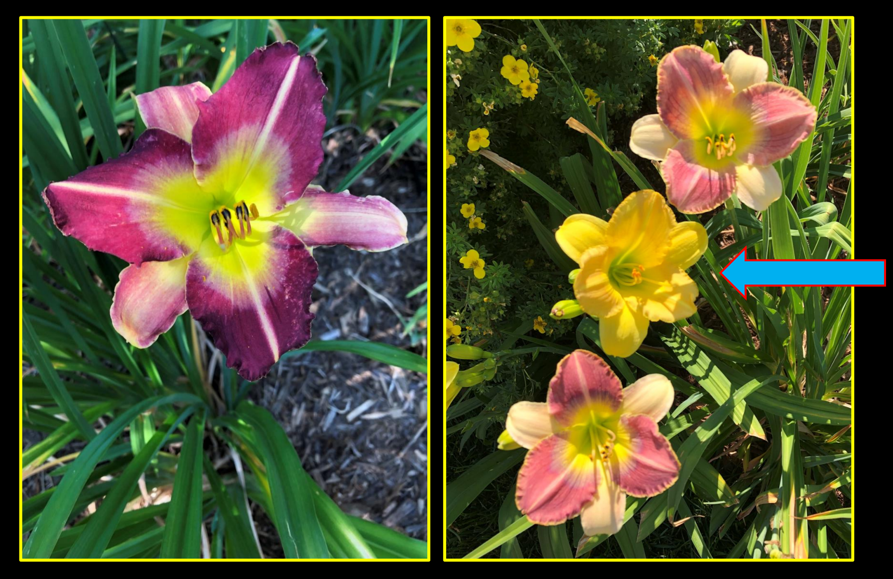
'Bellevue Beauty' (Poulton, 2014)