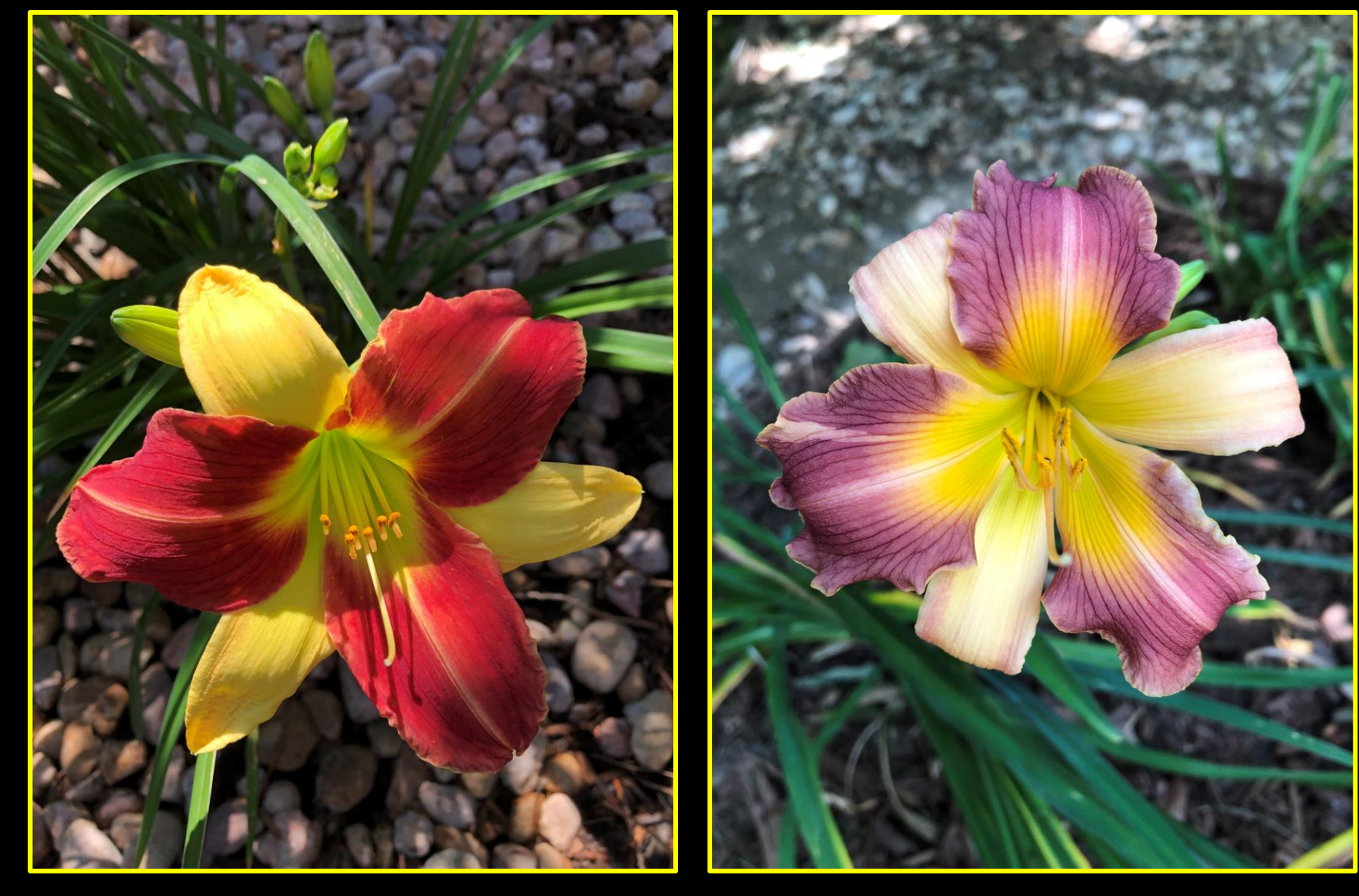
J17-2 Sdlg x Sdlg