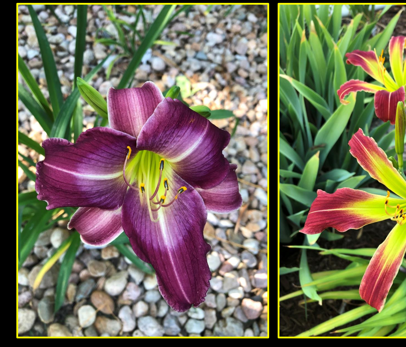
2011-28 Russell Bicolor x Baby Blue Eyes