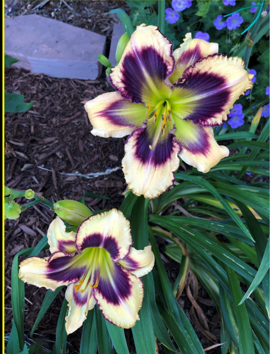
15-56-1 Delaney's Rainbow x Blue Beetle